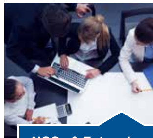
NGOs & Enterprise Supporting changing & increasing business applications for end users relying on connectivity