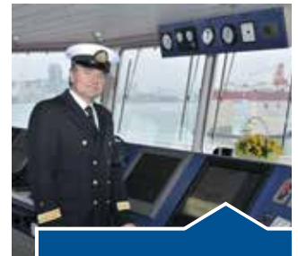
Cruise & Cargo Allowing enhanced onboard passenger & crew experience