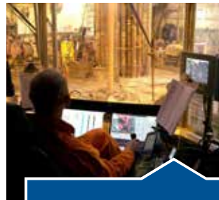
Oil & Gas Empowering onboard “applications-aware” networks

In addition to routed mode, Heights supports BPM mode for true layer 2 operation enabling seamless integration with service provider networks. A Heights network operating in BPM mode can be viewed as an Ethernet switch supporting VLAN and MPLS while benefiting from bi-directional IP optimization, WAN & GTP optimization, multi-tier QoS, ACM and dynamic bandwidth management. Heights remotes include extensive VLAN support including VLAN Access mode, trunk mode and QinQ. In BPM mode, remotes support traffic classification and QoS by VLAN ID, as well as MPLS Traffic Class Field.