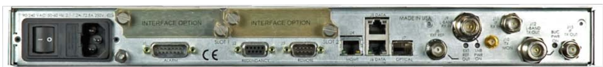
CDM-750 Rear Panel