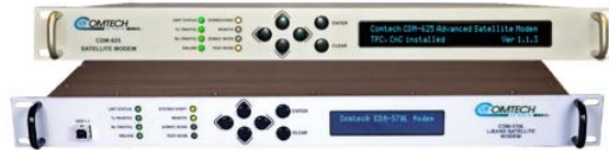
Indoor Unit (IDU)