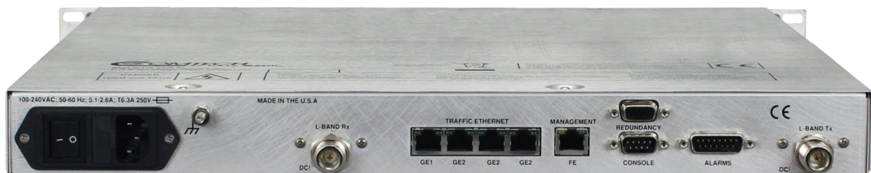
Back Panel View