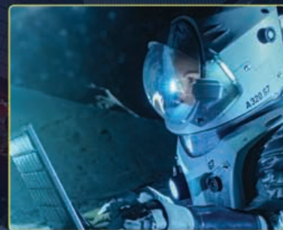
Investing in Space - page 28...