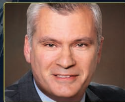
Comtech Satellite Network Technologies - page 12..

Investing in space Executive movers and shakers Q&A ST Engineering iDirect Race to embrace NewSpace Q&A Comtech Satellite Network Technologies Q&A Q-Tech Corporation Q&A Spire Global