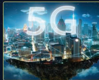
The race to embrace NewSpace - page 42...