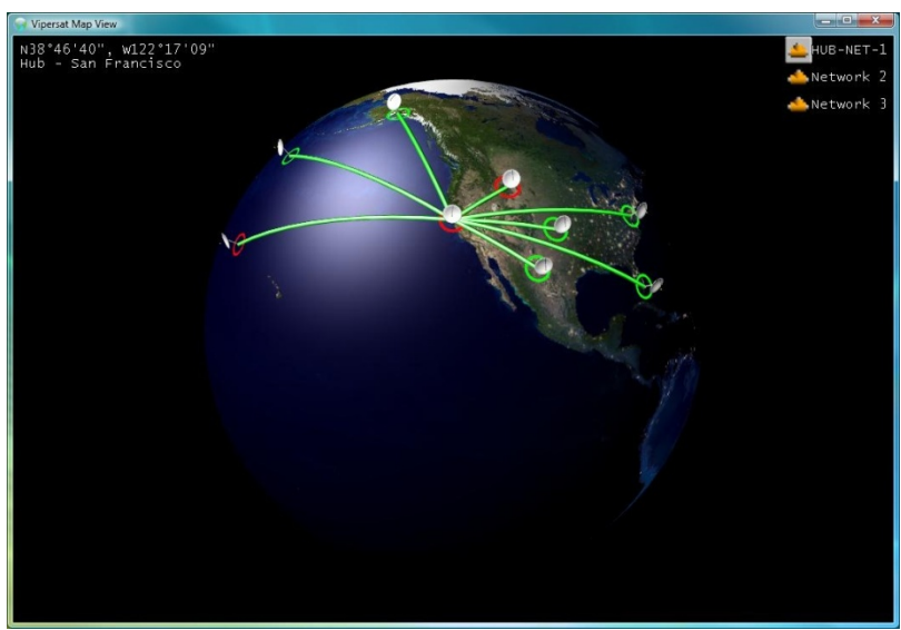
VMS Map View Displays Vessels/Vehicles On-the-Move