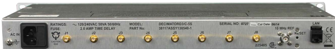
Spectrum VUE-8 Back Panel