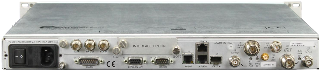
CDM-760 Back Panel