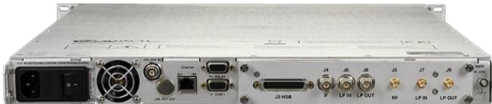
Typical Back Panel

The converters use our patented "Daisy Chain" integrated switching technology. The Daisy Chain design removes the relays associated with a centralized protection switch tray and distributes them across the individual converters. Daisy Chain technology successfully eliminates a central switching chassis, two power supplies, a microprocessor, and several long, costly cables. Widely accepted in the industry, Comtech EF Data's Daisy Chain provides both pricing and marketing advantages.