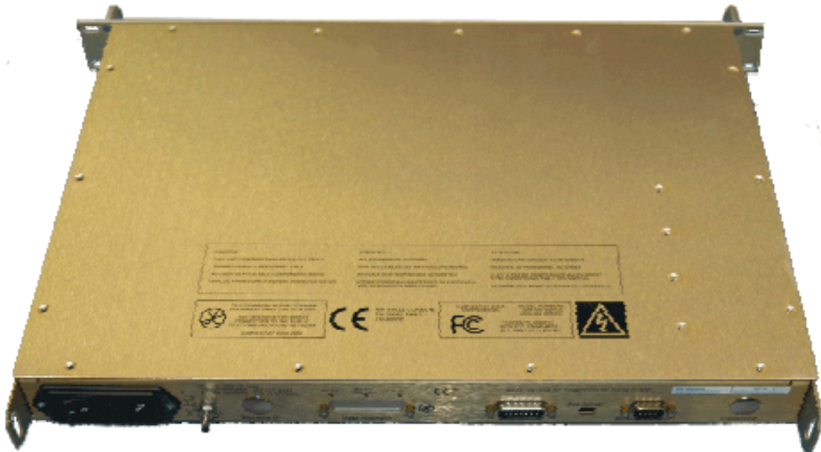
Figure 1-2 Cover